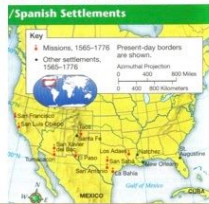
North American, Spanish, French and British Territories circa 1700